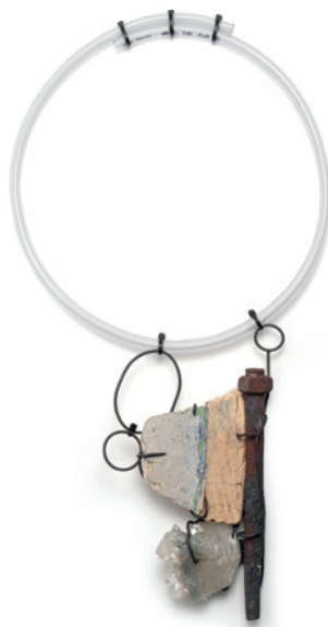
▲ Lynne Speake, Green Lines