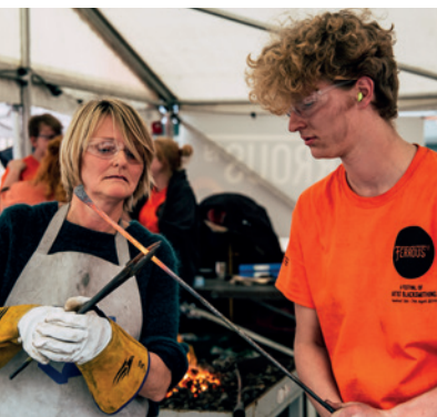
▲ Public Forging

Ever wanted to have a go at forging? Here's a chance to book a slot and hammer some hot metal yourself! The festival brings forges to High Town, each run by an experienced artist blacksmith who will guide you through the process. If you haven't booked your forging slot in advance (booking link at www.ferrousfestival.co.uk ), there may still be slots available on the day, so come along to the forge area in High Town to ask.