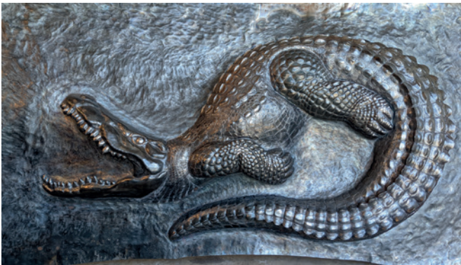
▲ Douglas Pryor

designers working in metal from all over the world. It's an internationally facing festival, with an ethos of inclusive practice that you can't see anywhere else, and it's also an opportunity for our students to reach out to the community and to contribute. It's a chance to teach, to inspire, to participate, and to make a difference through making."