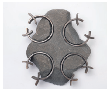
▲ Egor Bavykin, Image: Oliver Cameron-Swan