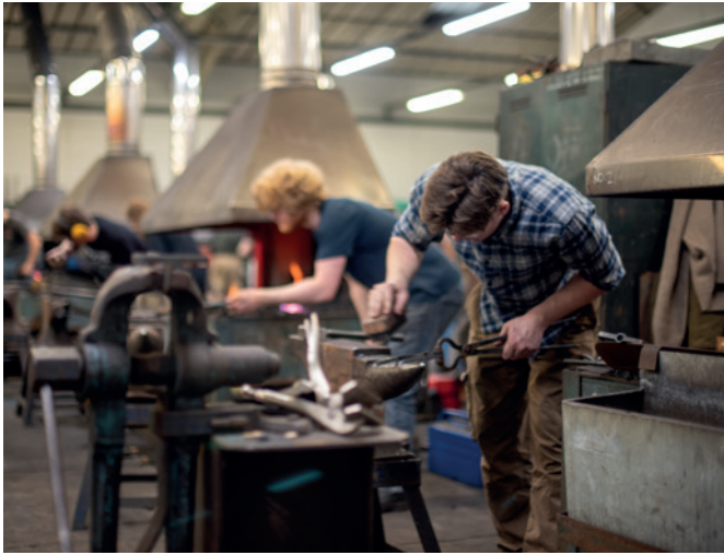
▲ Forging