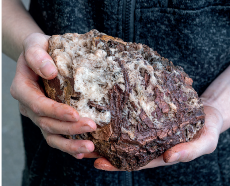
▲ Iron Ore from Clearwell Caves, Coleford