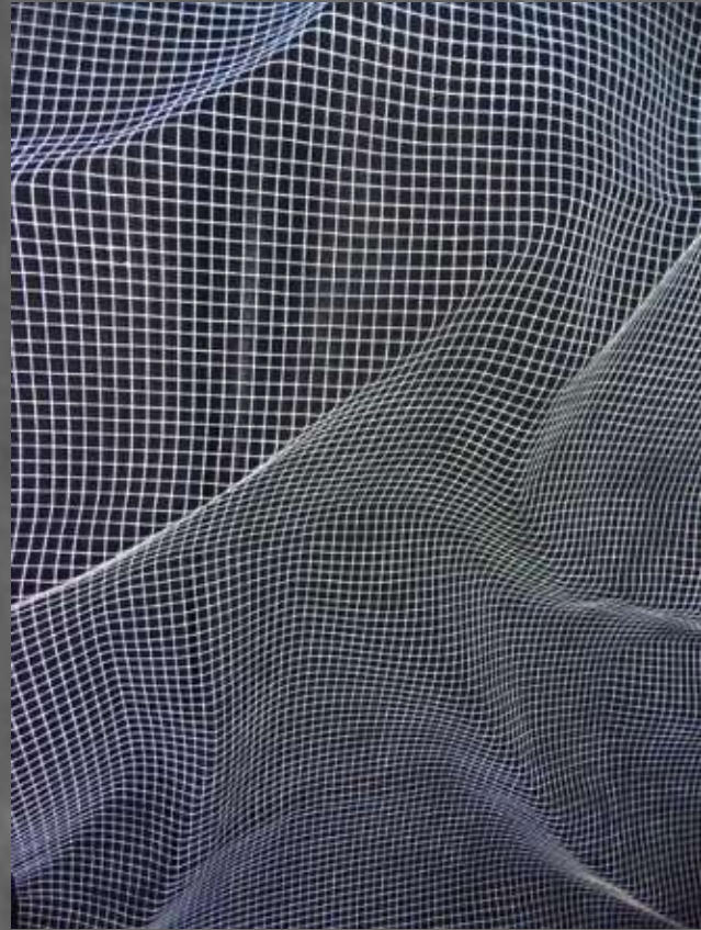
'untitled' Metal Mesh, Photography 29.7cm x 42cm 11inch x 17inch