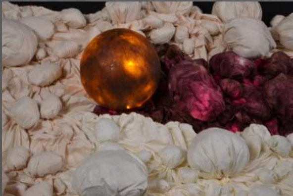
‘Lights, Lavender, Latex.’