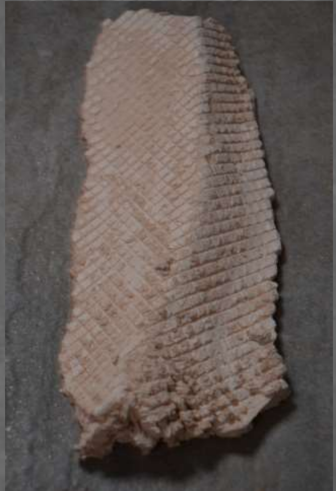
'untitled' Plaster 30cm x 9cm 1ft x 3.5inches