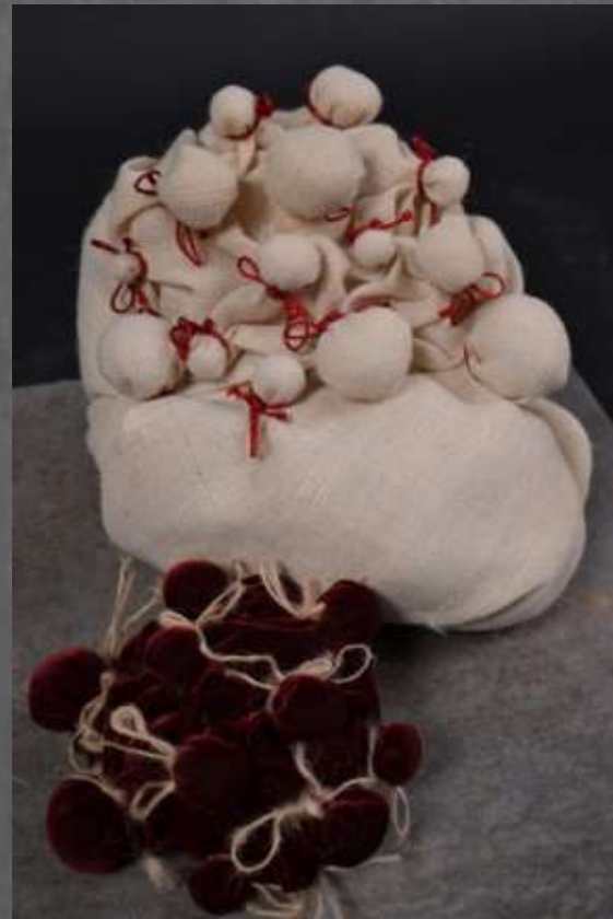
'untitled white' 46cm x 30cm x 30cm 1.5ft x 1ft x 1ft