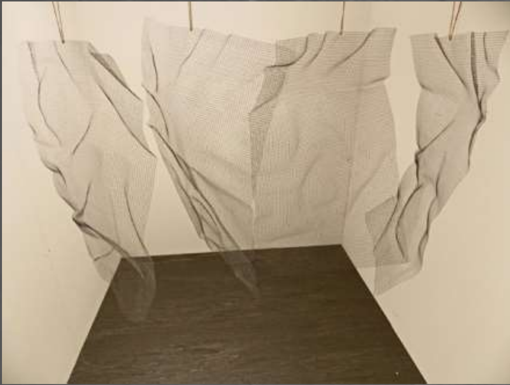
'untitled' Metal Mesh installation. 2m x 3m x 3m 6.5ft x 10ft x 10ft