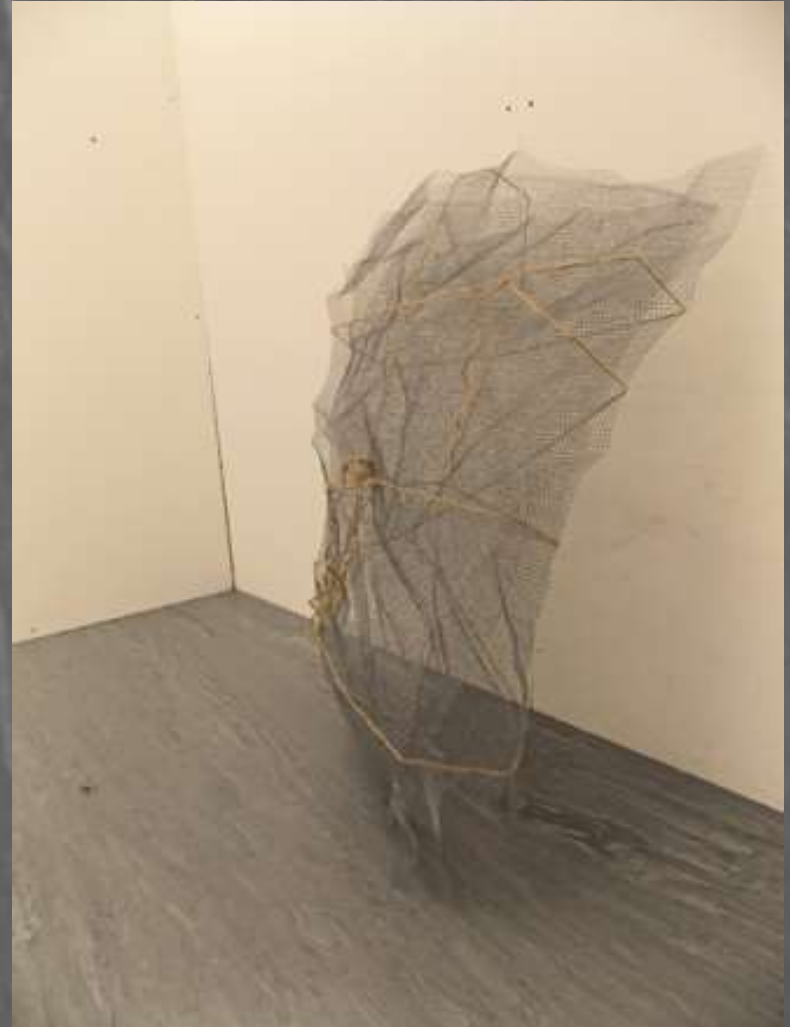
'untitled' Metal mesh and string. 1m x 50cm 3.5ft x 2ft