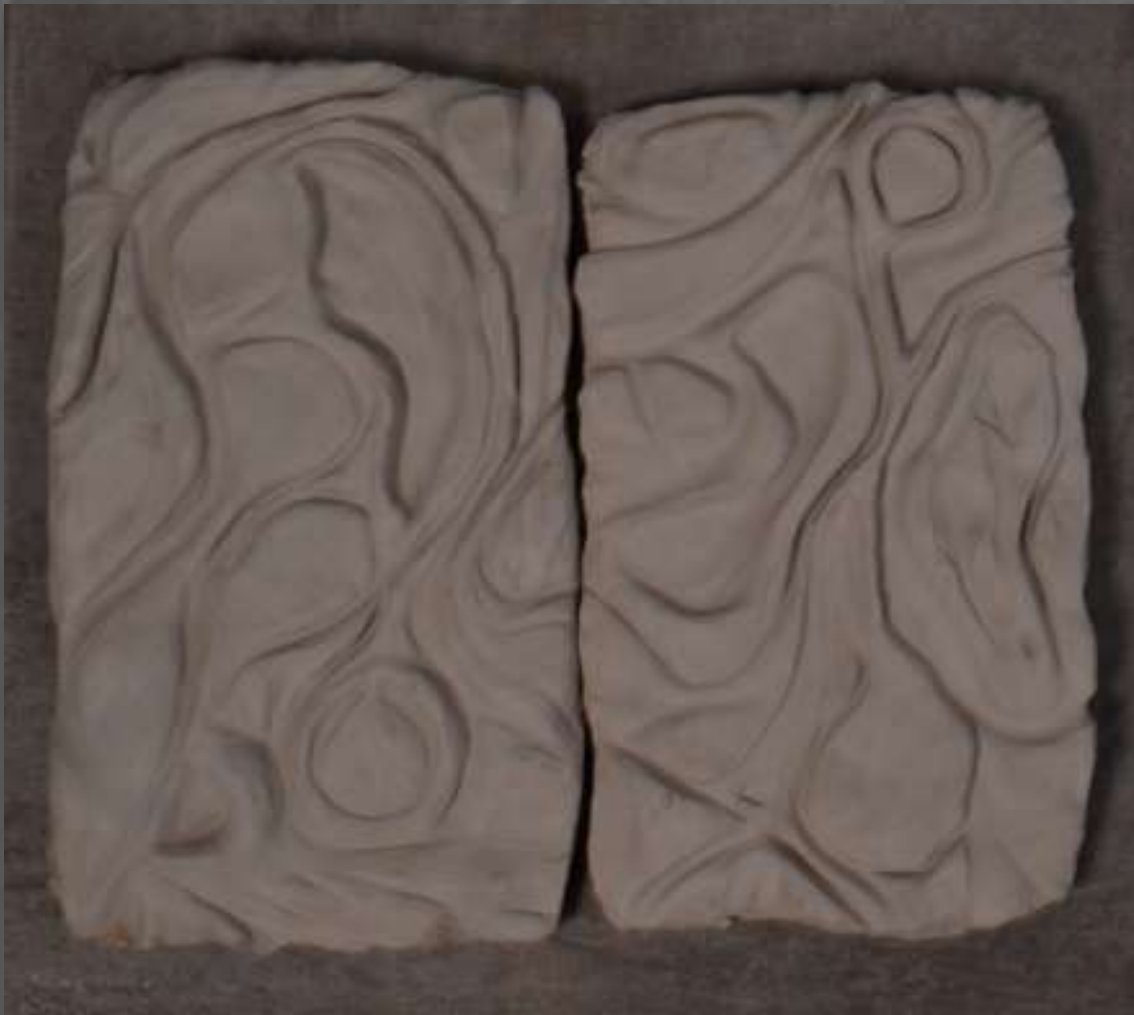
'untitled' Clay 36cm x 20cm each 14inches x 8inches each